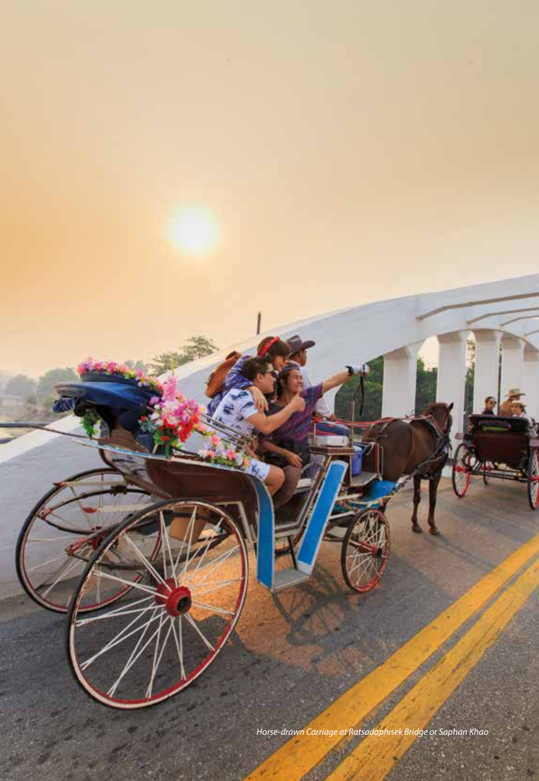
Horse-drawn Carriage at Ratsadaphisek Bridge or Saphan Khao