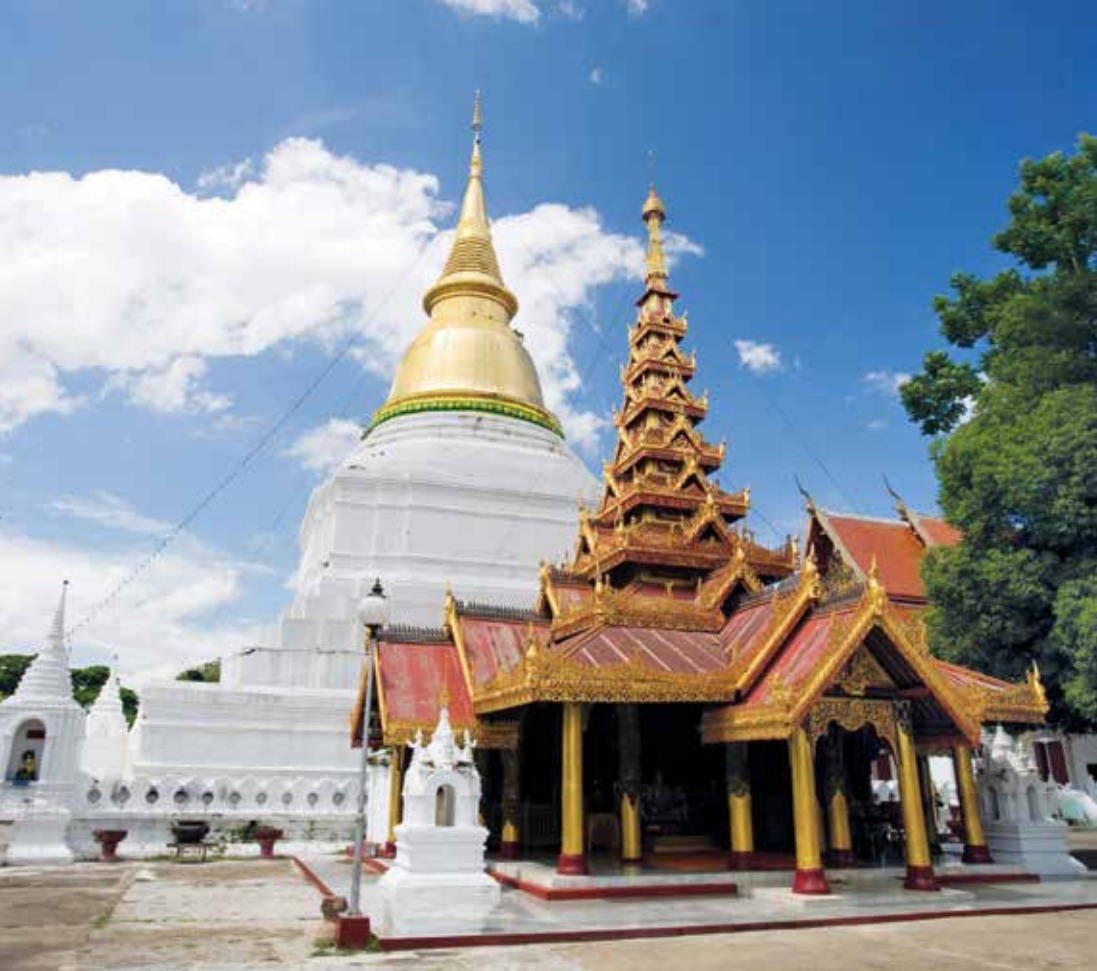
Wat Phra Kaeo Don Tao Suchadaram

Yannarangsi the ruler of the city of Lampang at that time. The ubosot (ordination hall) is the work of craftsmen from Xishuangbanna; it was mixed with Chinese art. Items of historical importance include the ancient city gate (Pratu Pong) and traces of turrets of Lampang under the rule of Phraya Kawila, as a fortress for the great battle against the Burmese in 1787. The Burmese camp was set up around 8 kilometres from the city to the north and sent troops to surround the city.