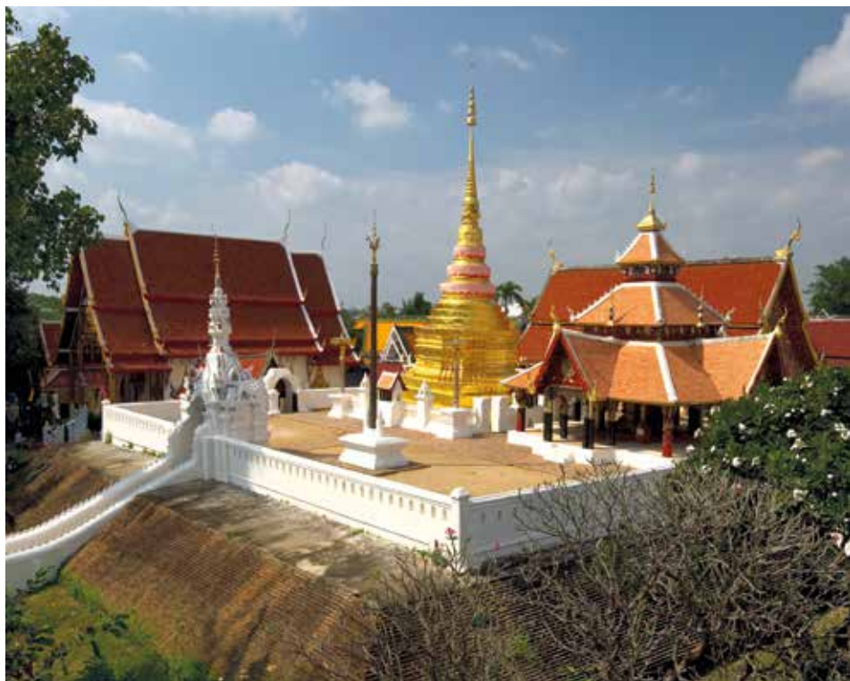
Wat Pong Sanuk Nuea

To get there: From the city of Lampang, follow the Lampang-Bangkok Road. Before the Highway Police Station, take a road parallel to the irrigation canal and turn left at the first junction. Go straight to the Khelang Bridge and Wat Ban Mo Som, and turn left. See a green sign on the right and go on for another 100 metres.