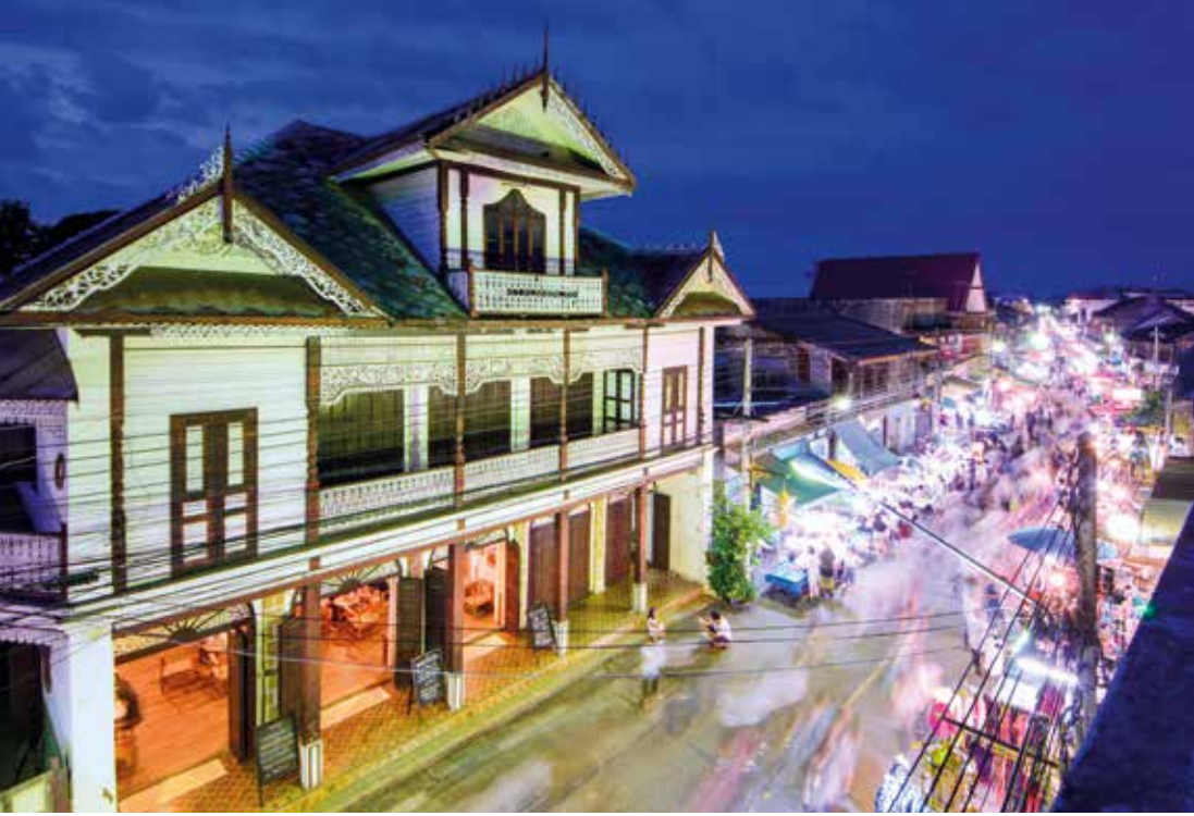
Kat Kong Ta Walking Street