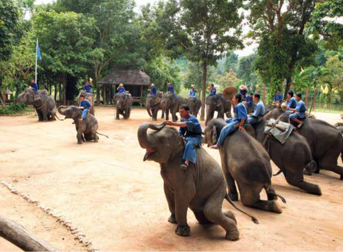
Thai Elephant Conservation Centre and Thung Kwian Plantation