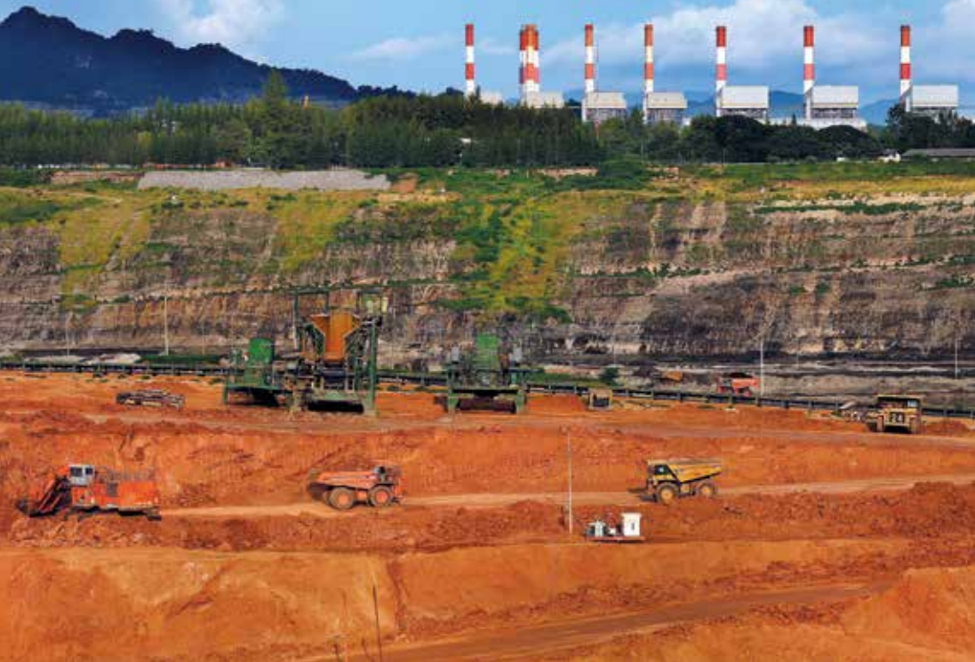
Mae Moh Mine

To get there: Take the Lampang-Den Chai Road for 10 kilometres and turn left at the Pha Lat Junction toward the EGAT office for around 26 kilometres. Alternatively, a Song Thaeo or minibus can be hired from the Boribun Market in Lampang town or at the Thai Osot Pharmacy Intersection on Thippawan Road; the trip takes about 30 minutes.