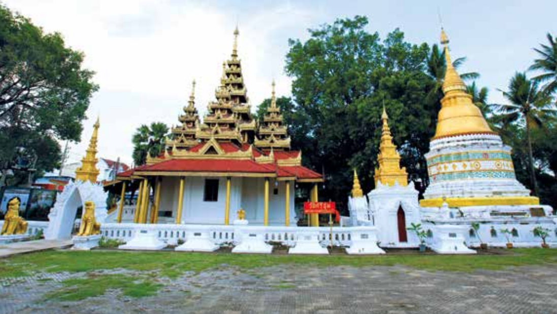
Wat Si Chum

in the reign of King Rama V by a rich merchant who was successful in the logging business when Lampang was a centre of trade and logging. The important architectural building is the wooden wihan (image hall) with a layered gable roof, nine finials, a carved wooden ceiling, and exquisite tinted-glass decorated round columns.