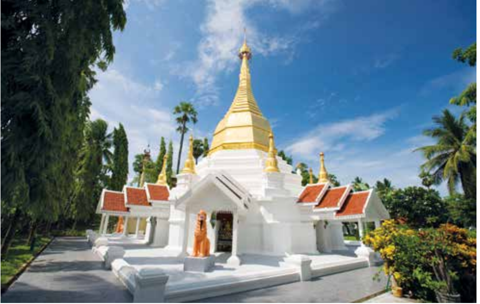
Wat Pa Fang

To get there: Wat Si Chum is located on the Si Chum-Mae Wa Road, Tambon Si Chum. Follow Phahonyothin Road to the Boonyawat Witthayalai School and turn left at the intersection toward Si Chum Road for around 100 metres. The temple entrance is on the right.