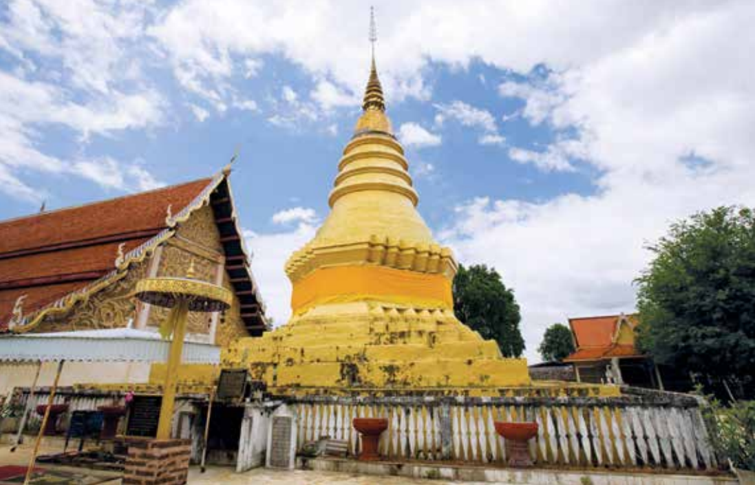
Wat Phrathat Chom Ping

and inscribed with Tai Nuea letters in Pali can be seen at the Rong Tham.