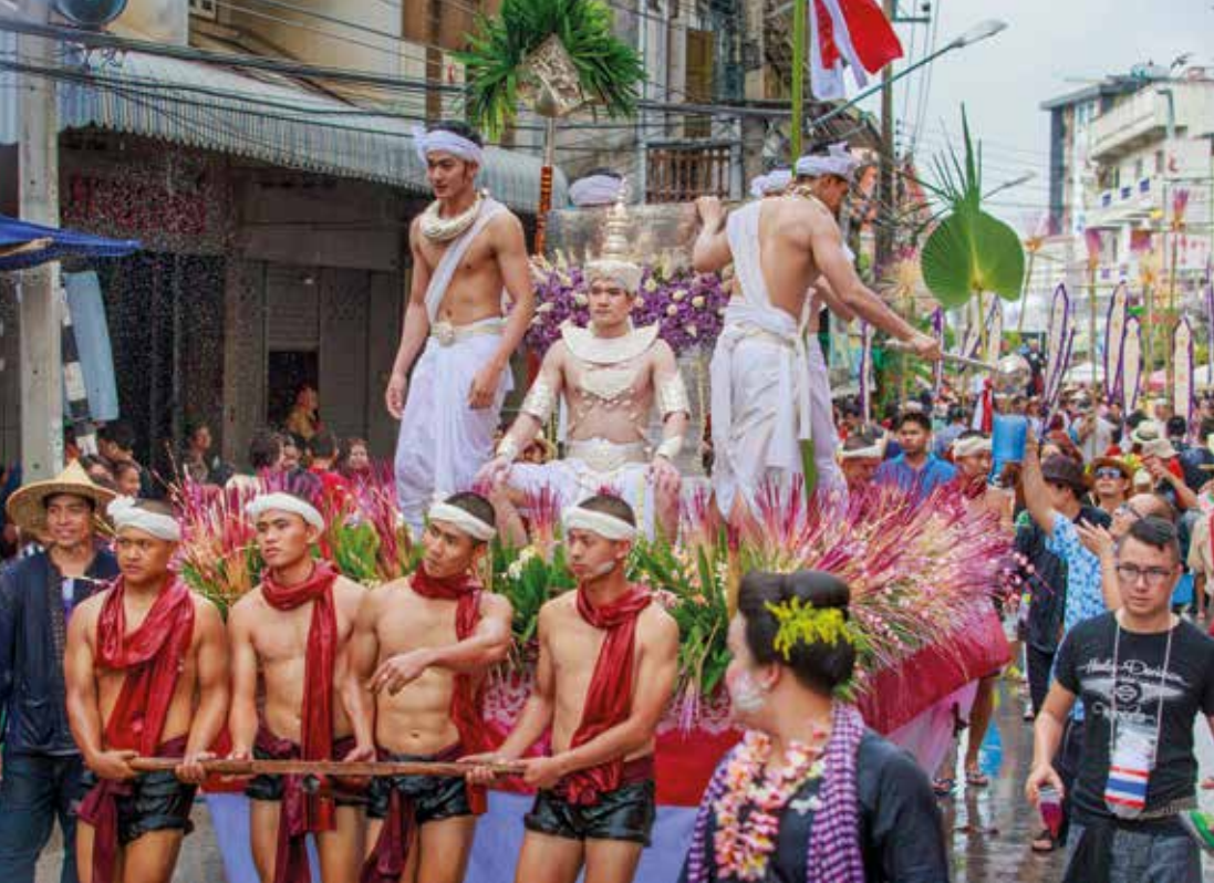
Salung Luang and Songkran Festival

and necessary things, as Buddhist offerings to be given to the temple.