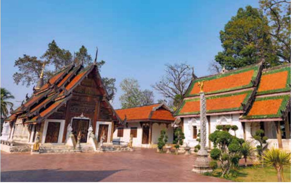
Wat Pratu Pong

Apart from browsing for various local and hand-made products, authentic food, and souvenirs, tourists can enjoy cultural performances on the activity ground that will take them back to the glorious old days of Lampang once again. The walking street market is open every Saturday-Sunday from 06.00-10.00 p.m.