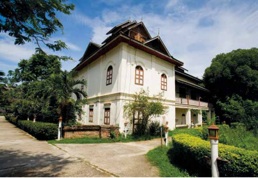
Wat Chai Mongkhon

Inside the image hall is a beautiful bronze Buddha image which was built in Mandalay, Republic of the Union of Myanmar.