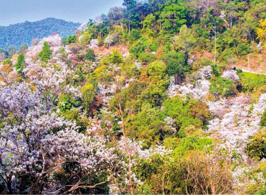
Blooming Flowers of Orchid Trees

boulders are scattered across the area covered with lingering steams coming out of the wells. An average temperature of the hot springs is 73°C. Eggs of hens and partridges are often boiled in the wells. After 17 minutes in the wells, hen yolk is hardened with a tasty nutty flavour while the white becomes liquid like a turtle's.