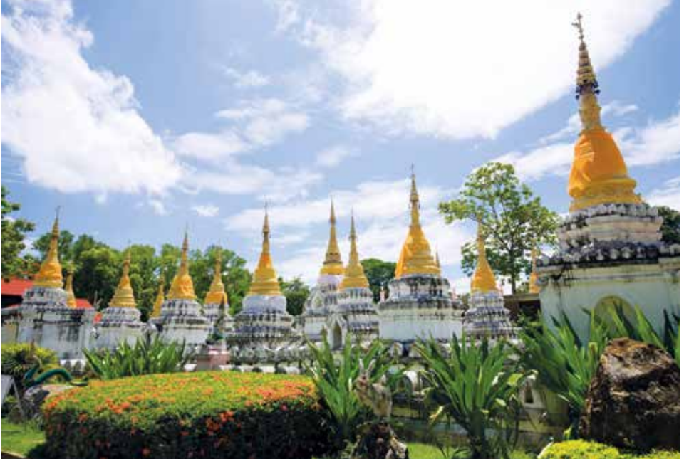
Wat Chedi Sao Lang

aged around the 16 th century with a measurement of 9.5 inches across the lap and 15 inches high. It is the first golden Buddha image that has been registered as a national ancient object. To get there: Follow Highway No. 1035 (Lampang-Chae Hom). It is about 500 metres from the Luangpho Kasem Dhamma Retreat (Trilaksana Cemetery).