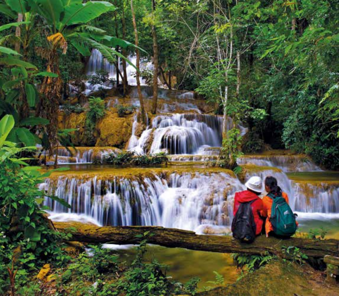
Namtok Mae Ke

Electricity Generating Authority of Thailand (EGAT) has provided viewpoints in the form of small parks adorned with decorative and flowering plants, a panoramic view of the far below working backhoes can be seen.