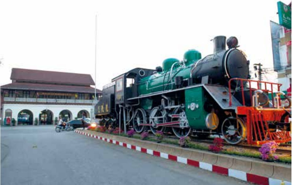
Nakhon Lampang Railway Station

Luangpho Dam. This image is one of four Buddha images built in 1968 by the Territorial Defense Department to be enshrined at the four cardinal directions of the country. Therefore, this is the image of the North and the city image which is worshipped by the people here. Now, the image is mostly covered with gold leaf by the people who come to pay respect.