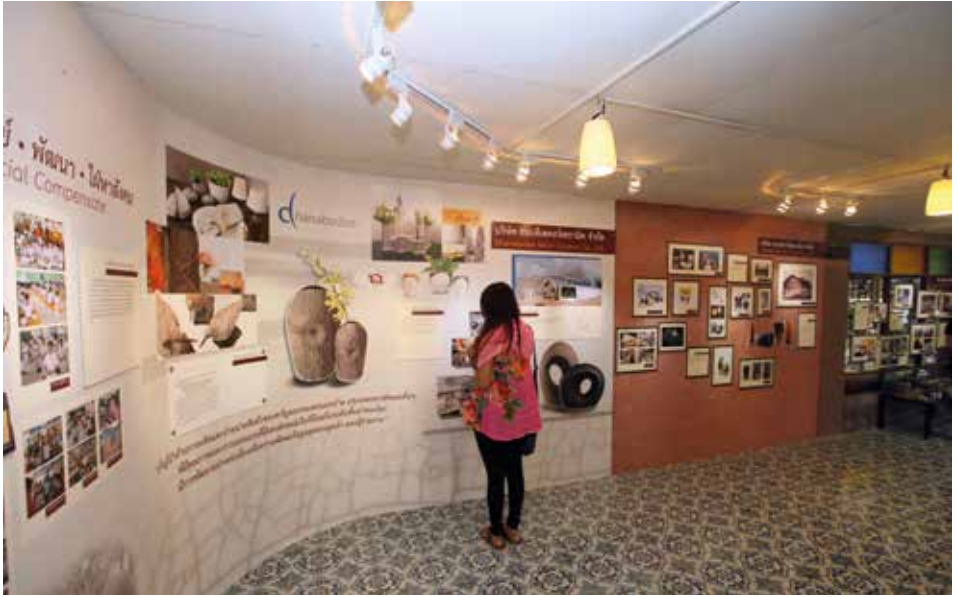
Dhanabadee Ceramic Museum