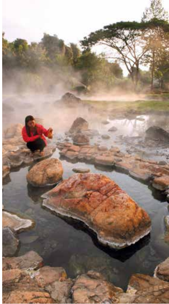
Chae Son Hot Wells

covers an area of 592 square kilometres in Amphoe Chae Hom, Amphoe Mueang Pan