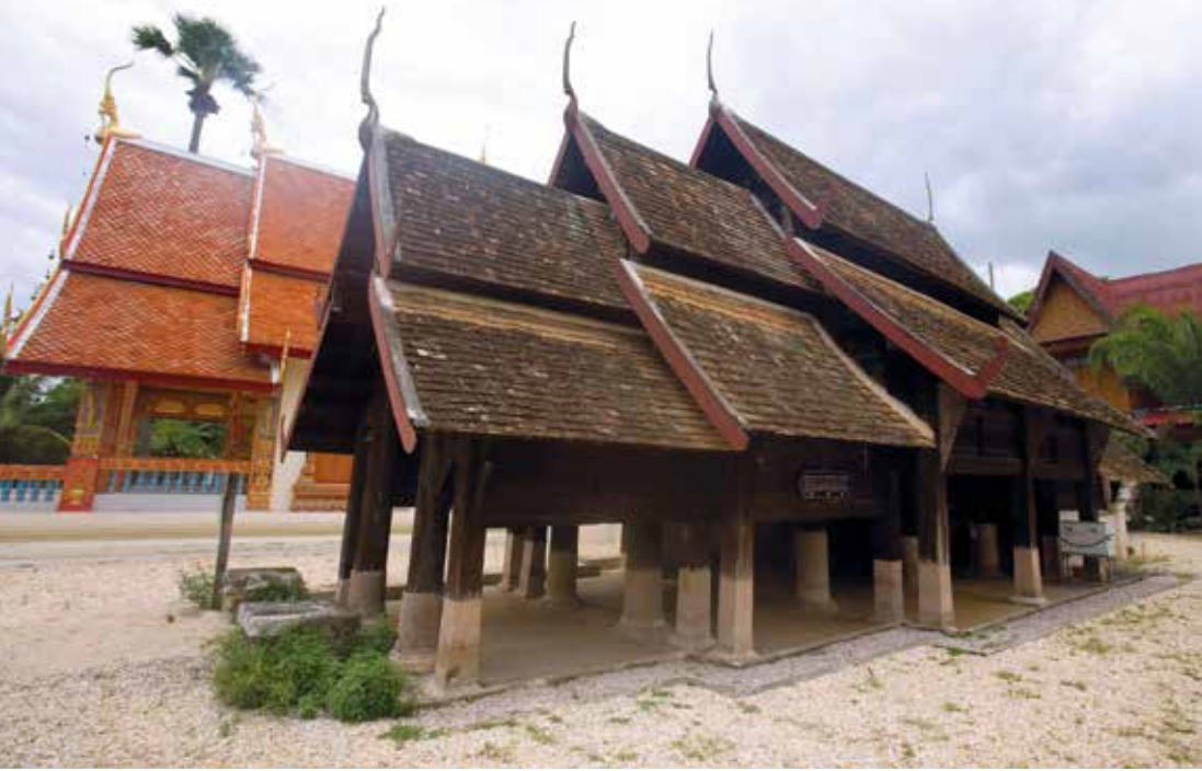
Wat Pong Yang Khok