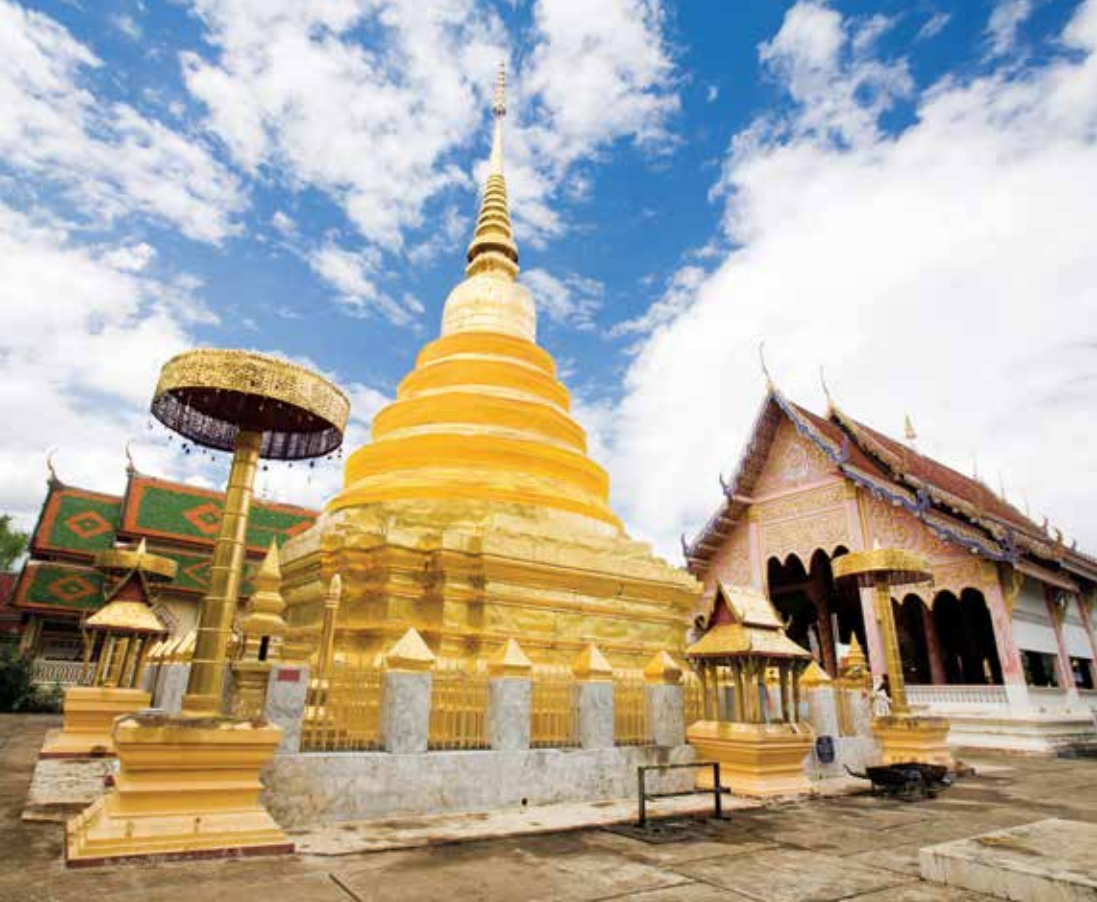
Wat Phrathat Sadet