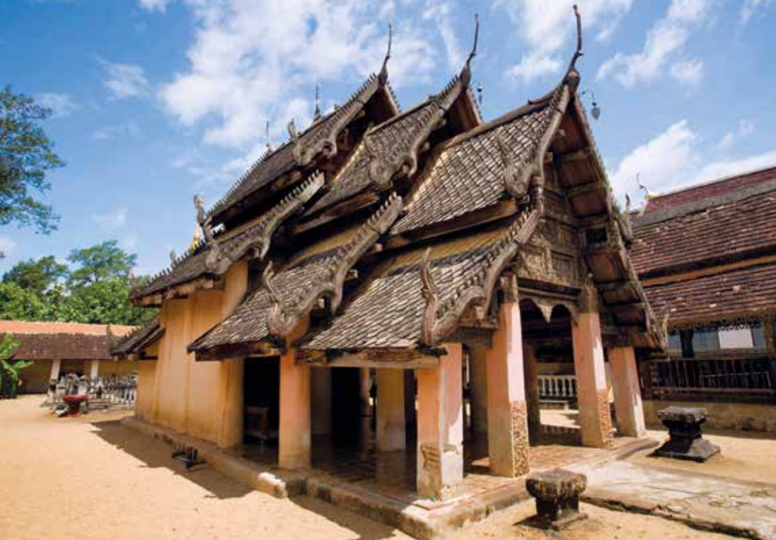
Wat Sela Rattana Papphataram

Phrathat Lampang Luang is a pagoda associated with people born in the astrological year of the ox since the construction started and was completed in the year of the ox. It has a lotus base with torus moulding with a Lanna-style circular body covered with Thong Changko (alloy plate). The umbrella top is made of gold embossed with different types of the Thai asterisk pattern. The features of this pagoda had influence on Phrathat Hariphunchai and Phra Borommathat Chom Thong. Enshrined in the pagoda are the Lord Buddha's hair and bone relics from the right forehead and the front and back neck. A bullet hole can be seen on the brass fence around the pagoda. This was made by Nan Thip Chang who shot Thao Mahayot.