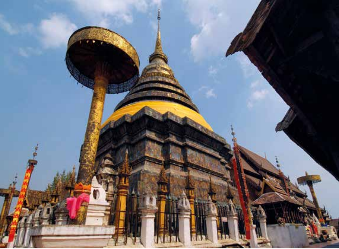
Wat Phrathat Lampang Luang

In addition, some caves and waterfalls have been found, but not yet developed to be tourist attractions; such as, Namtok Huai Mae Pu, Namtok Huai Khang, Pha Yong, Tham Huai Daeng, Tham Kon Hoi, and Tham Mae Keng.