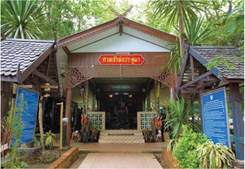
Chao Pho Pratu Pha Shrine

Accommodation: Please contact the Doi Luang National Park in Tambon Mae Yen, Amphoe Phan, Chiang Rai, at Tel. 0 5360 9042, or the Department of National Park, Wildlife and Flora at Tel. 0 2562 0760 www.dnp.go.th